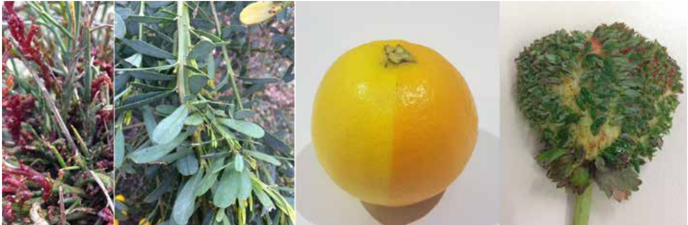
Witches' broom on Jacksonia causing red deformed growths, fasciation on Templetonia , chimera on orange rind, and phyllody on strawberry.

Plant abnormalities have intrigued gardeners and botanists alike for many years. These abnormalities sometime result in strange growths or odd variations. Causes include environmental or genetic factors, pests, and disease. Below are some common examples, and perhaps you've noticed one or two of these before?